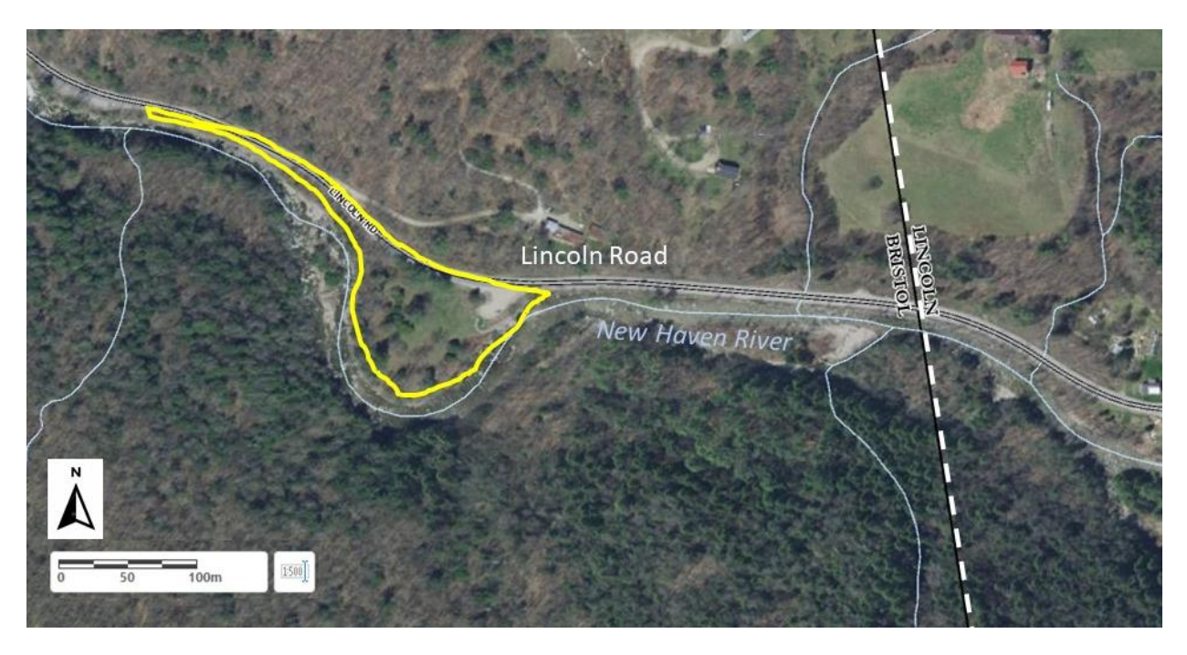
Figure 1. Approximate boundaries of Eagle Park, accessed from a parking area on the south side of Lincoln Road (Property boundaries, approximated from Bristol Tax Parcel Maps, are for planning purposes only and do not represent actual surveyed boundaries).

Eagle Park is a 5.5-acre parcel located at 908 Lincoln Road approximately 0.7 mile east of Bartlett's Falls near the Bristol-Lincoln town line (Figure 1). The park offers a sparsely-forested meadow along the New Haven River for bird-watching, picnicking, and recreating, and features the Chuck Baser Memorial Universal Fishing Platform that provides Americans with Disabilities Act (ADA) compliant access to the river for fishing. The property is owned by the Town of Bristol, and is jointly managed by the Bristol Selectboard, the Recreation Department and the Conservation Commission.