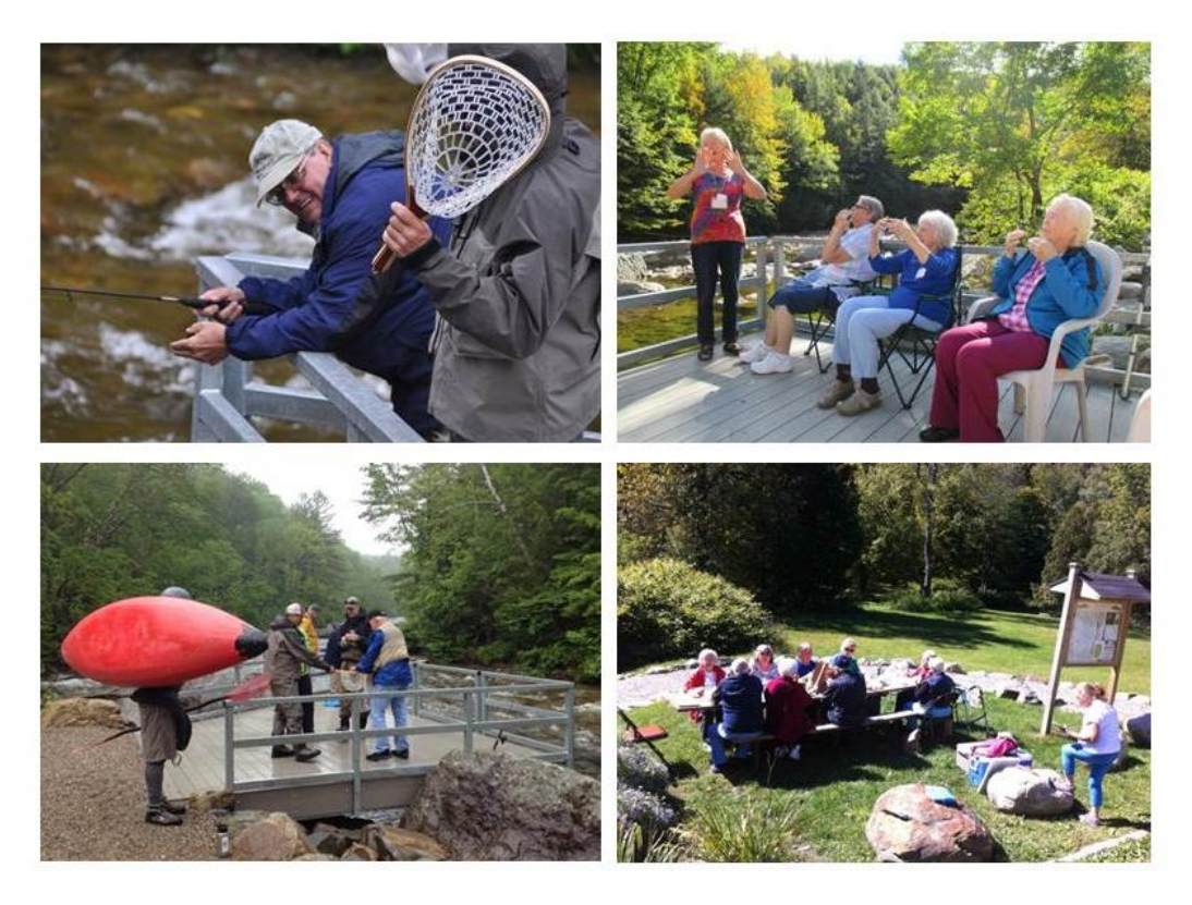
Figure 5. Eagle Park sees regular use by anglers, kayakers, picnickers and fitness classes.