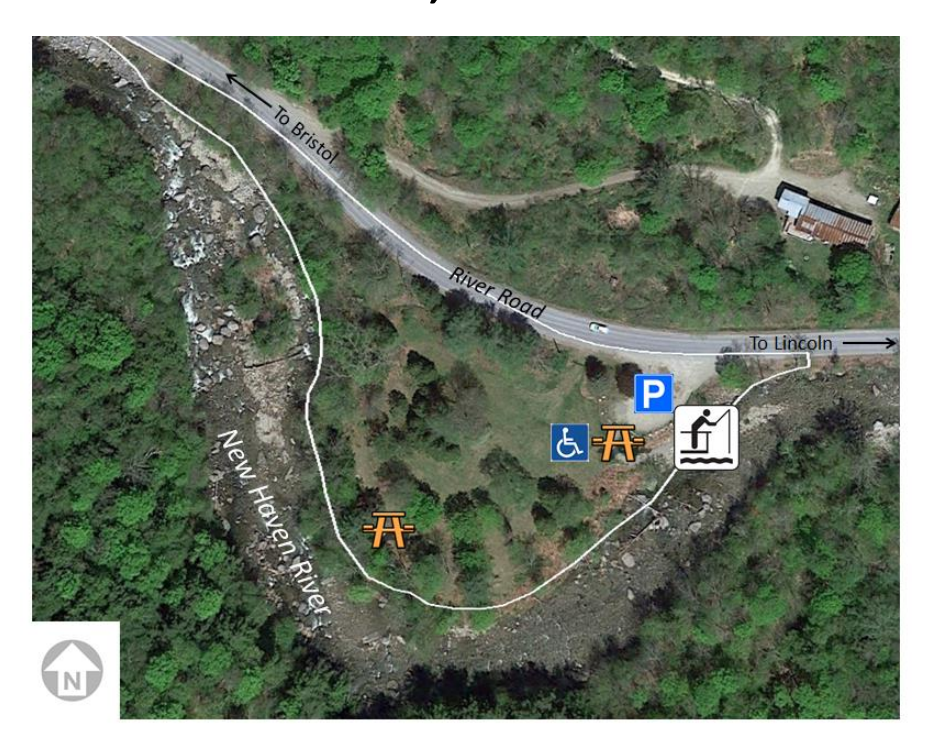
Prepared by: Bristol Conservation Commission Approved by Bristol Selectboard, 30 October 2023