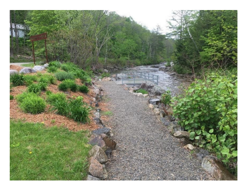
Figure 9. Access ramp leading to the UFP is flanked by a perennial garden on the north and invasive Japanese Knotweed to the south. (Photo dated prior to 2018).

Eagle Park is a day-use site open from dawn to dusk. No public access is allowed between dusk and dawn, except for specific activities granted prior approval by the Selectboard. Motorized vehicles are not permitted at the park. Visitors may enjoy swimming or wading in the river, however no life guard is available. Trespassers between dusk and dawn will be handled according to the Town's Trespass Ordinance.