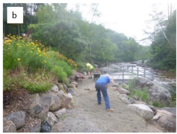
Figure 6. Universal Fishing Platform (a) receives ice during thaw event on January 30, 2013. (b) Bristol CC members replace gravel on access ramp to the platform during an August repair activity following flooding on July 1, 2017 that eroded a segment of the walkway.

Two past flood events were sufficiently impactful to result in more substantial damages. Both floods were federally-declared disaster events. The first occurred in 2011 on August 28 during Tropical Storm Irene – a flood with an annual exceedance probability of approximately 3% in the New Haven River watershed (Olson, 2014). The gravel-packed access ramp was washed out, and expenses to restore the ramp were reimbursed, in part, through federal and state grants. The second substantial flood event occurred on November 1, 2019. Heavy rains following a wet October, generated peak flows on the New Haven River with an annual exceedance probability of 1 to 2% (Olson, 2014). Post-event site inspections and survey indicated that floodwaters rose to approximately 1 foot over the top surface of the platform, and the upstream anchoring boulder moved (SLR Corp presentation to Selectboard, 9/27/21). Brackets attaching the platform were separated from the boulder, putting the platform out of level. The concrete ramp was undermined and cracked.