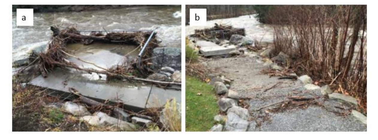
Figure 7. (a) Large woody debris was caught by the UFP railings during flooding on Oct 31 – Nov 1, 2019. (b) Floodwaters eroded gravel from the access path and the concrete slab cracked when undermined during this same event.

Two past flood events were sufficiently impactful to result in more substantial damages. Both floods were federally-declared disaster events. The first occurred in 2011 on August 28 during Tropical Storm Irene – a flood with an annual exceedance probability of approximately 3% in the New Haven River watershed (Olson, 2014). The gravel-packed access ramp was washed out, and expenses to restore the ramp were reimbursed, in part, through federal and state grants. The second substantial flood event occurred on November 1, 2019. Heavy rains following a wet October, generated peak flows on the New Haven River with an annual exceedance probability of 1 to 2% (Olson, 2014). Post-event site inspections and survey indicated that floodwaters rose to approximately 1 foot over the top surface of the platform, and the upstream anchoring boulder moved (SLR Corp presentation to Selectboard, 9/27/21). Brackets attaching the platform were separated from the boulder, putting the platform out of level. The concrete ramp was undermined and cracked.