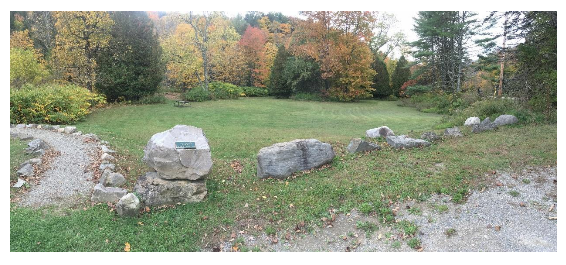
Figure 4. Maintained meadow just south of the Eagle Park gravel parking lot; entry to ADA-compliant gravel-packed access path to Universal Fishing Platform.

Tree species include Eastern Hemlock, White Pine, Ash, Yellow and White Birch, Sugar Maple and Red Maple.