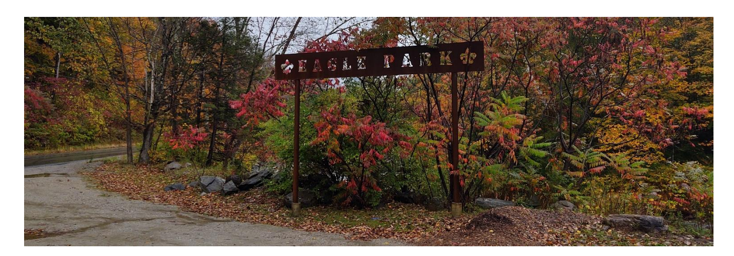
Figure 3. Eagle Park sign

Following acquisition of the parcel in 2000, the town of Bristol maintained Eagle Park as a dayuse area with recreational access to the New Haven River. Boulders were installed along the perimeter of the parking area to prevent vehicular access through the park. The grass lawn areas continued to be mowed with access for landscaping equipment permitted through a locked gate along Lincoln Road. A sign for the park was constructed as part of a Boy Scout eagle project (Figure 3).