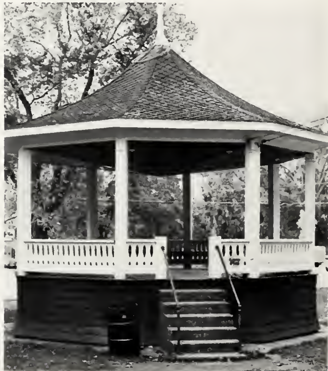
Bristol Bandstand — located on the Park — 1979

Early photo of the Bristol bandshell as it looked in the 1930's